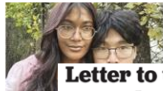
A photo of two women, a sister and a sister friend, smiling.

NEGATIVES BEHIND IN THE PAST IF YOU LIKE BEING WHO YOU ARE