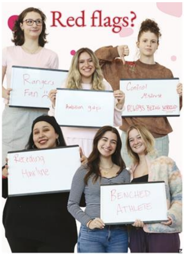
A group of young women holding signs with phrases like "Rangers Fan", "Control Misery", "Ambition gap", "Always being weird", "Kerching Hairline", and "BENCHED ATHLETE".