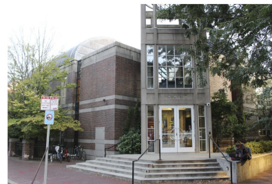
Rosovsky Hall, which houses Harvard Hillel. Newly released Department of Justice emails show that former Harvard Hillel leaders solicited donations from Epstein in 2010 and 2011, years after his criminal conduct became public.