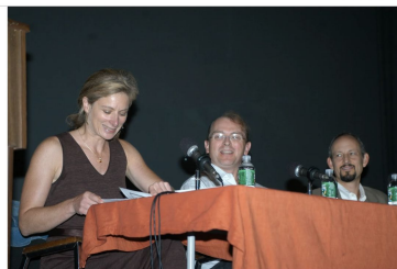
Harvard physicist Lisa Randall participates in a campus panel discussion in 2006. Newly released DOJ records later revealed years of contact between Randall and Jeffrey Epstein.