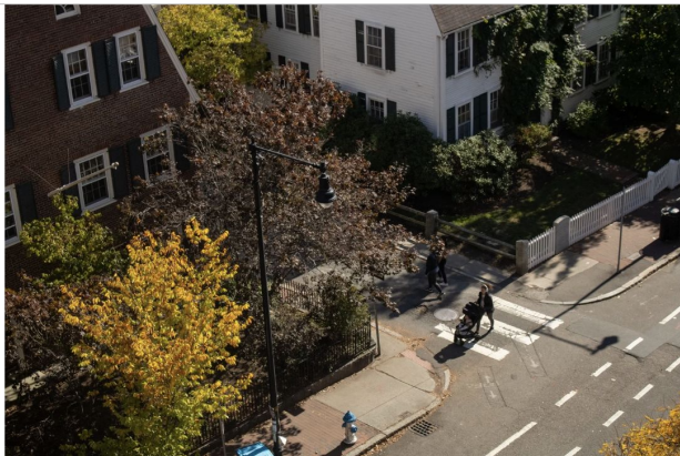
Jeffrey E. Epstein rented a house near Harvard Square in the early 1990s.

Jeffrey E. Epstein, the financier later convicted of sex offenses, rented a house near Harvard for several years in the early 1990s, making sporadic overnight visits and hosting a small circle of guests that included Ghislaine Maxwell and at least one young woman, according to a former live-in housekeeper and newly released Department of Justice records.