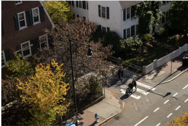
Jeffrey E. Epstein rented a house near Harvard Square in the early 1990s.