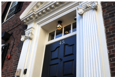
The Hasty Pudding received at least $225,000 more in donations from Jeffrey Epstein than was previously known, according to documents released by the Department of Justice on Friday.