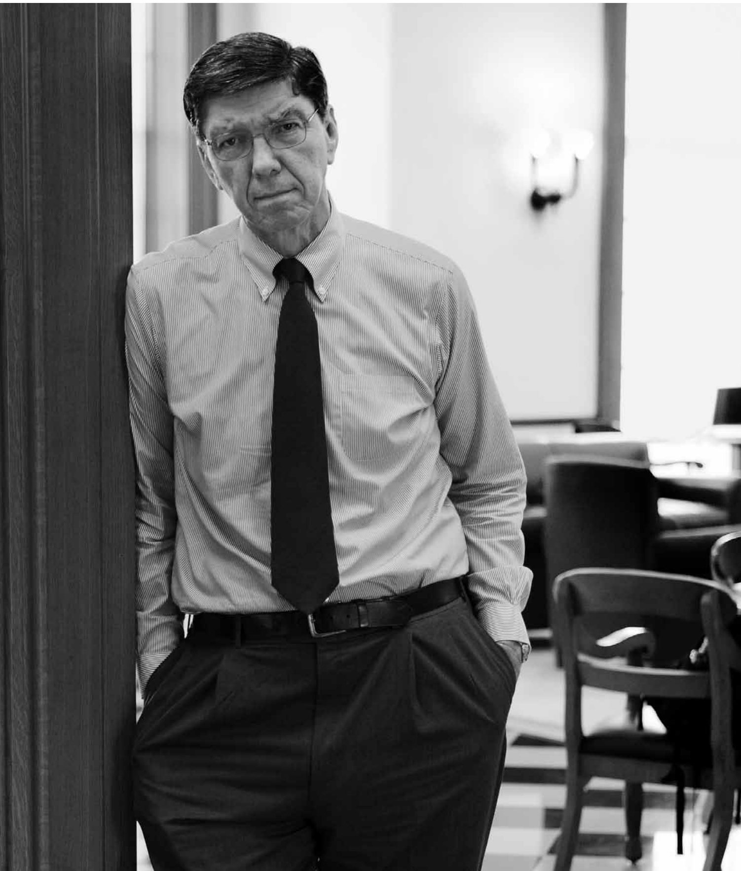
Clayton M. Christensen of Harvard Business School developed the theory of disruptive innovation.